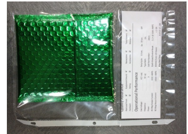
Operating Manual and Drawings

The manual is shipped with the unit in electronic format wrapped in a green bubble wrap mailer within the Accessories Box. In the manual is an extensive step by step process of how to assemble the enclosure and attach it to the unit.