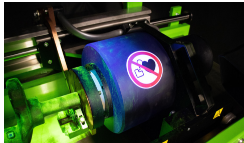
Larger flux coils for maximum multi-directional part testing capacity

For more information on the Universal WE, visit magnaflux.com/Universal-WE or contact Magnaflux customer service at support@magnaflux.com or +1 847-657-5300.