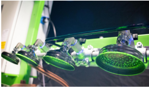
Large surface shower for hands-free bathing